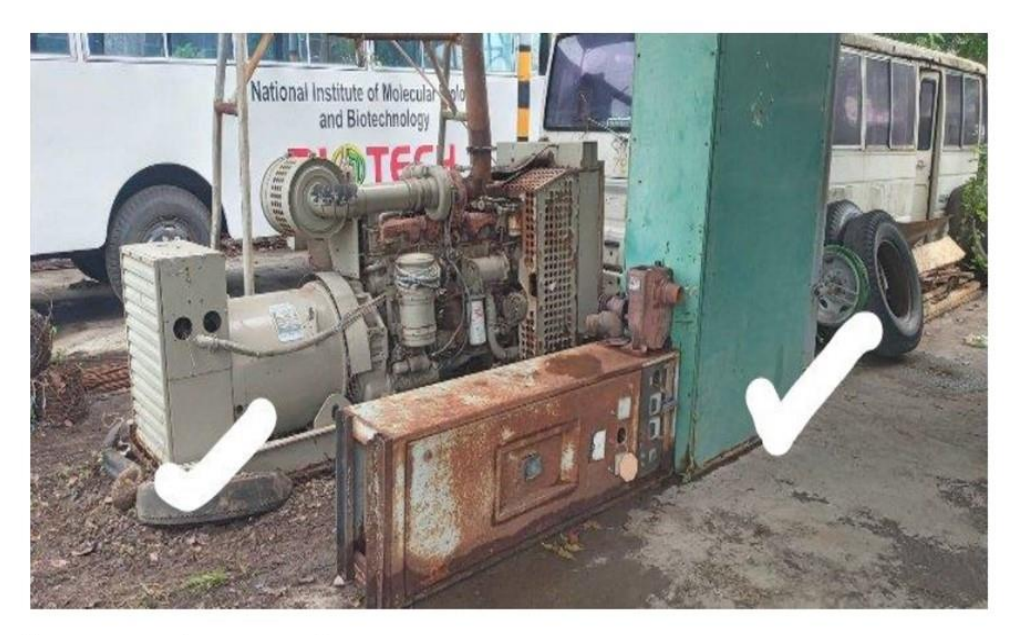
"As is Where is" BIOTECH